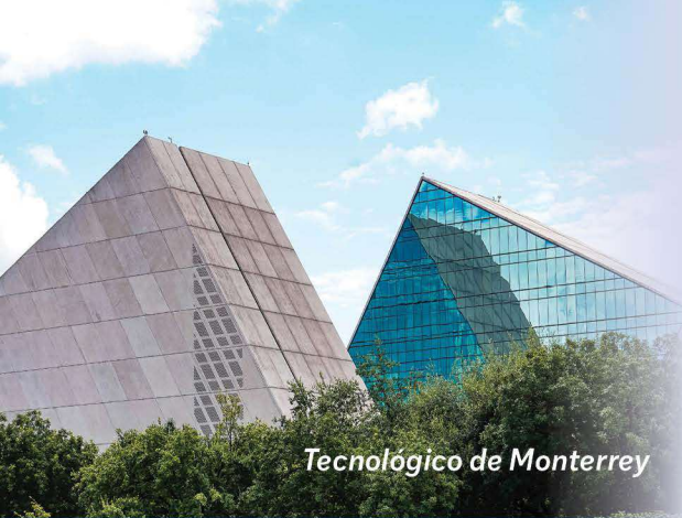
Tecnológico de Monterrey